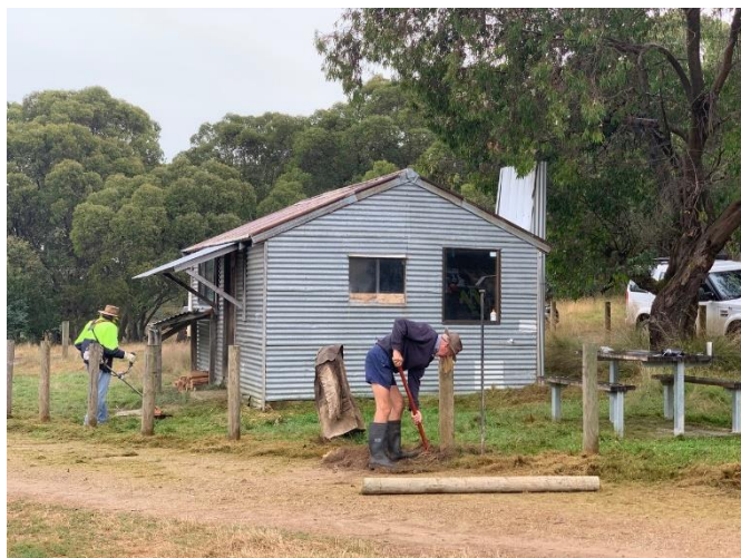
Image 1 LROCG Volunteer Work.

Our volunteers do a fantastic job helping the community with Four Wheel Drive Victoria projects such as Camp Host, Track Clearing and High-Country Hut maintenance. Even your track clearing you may do on a trip counts, so club trip leaders are encouraged to log time spent clearing tracks and send in your volunteer hours worked. It is extremely important to Four Wheel Drive Victoria to be able to actually represent the hard work our amazing volunteers do on a regular basis