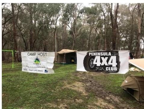
Image 2 Peninsula 4x4 Camp Host