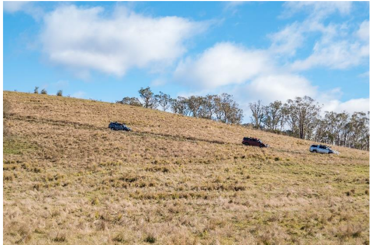
Convoy During the Regional Reps Weekend - Mark Currie

Four Wheel Drive Victoria are on the lookout for as many high resolution photos of your club and cars out on trips, undertaking volunteer works including track clearing and camp hosts. Pictures of camp set ups would also be much appreciated. Both the person who took the photo and the club will be credited on each photo used and number plates will be removed from the photo for privacy. Please email projects@fwdvictoria.org.au with any photos you wish to submit including the name of who took the photo and the 4WD club. The location of the photo would also be greatly appreciated. These photos will be used on the Four Wheel Drive Victoria website and across Four Wheel Drive Victoria's social media platforms. A great opportunity to showcase your club and the great times you and your club have!