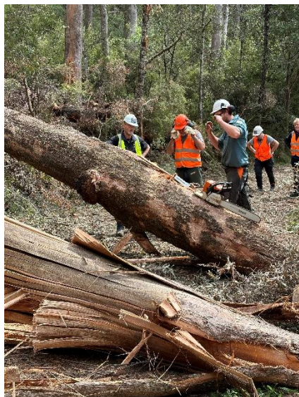
Mansfield Alpine 4WD Club undertaking Track Clearing