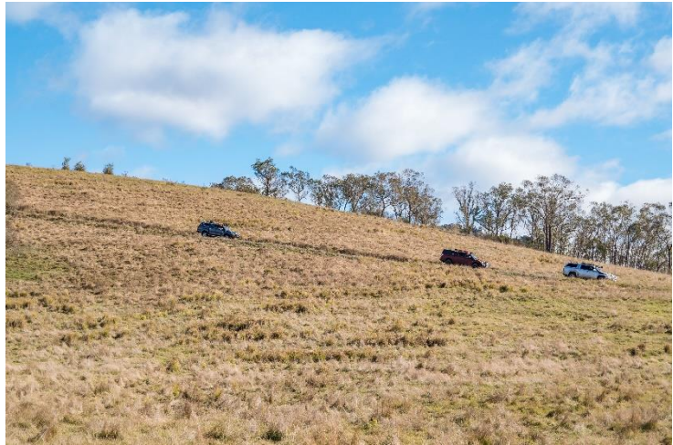
Image 1 Convoy During the Regional Reps Weekend

Four Wheel Drive Victoria are on the lookout for as many high resolution photos of your club and cars out on trips, undertaking volunteer works including track clearing and camp hosts. Pictures of camp set ups would also be much appreciated. Both the person who took the photo and the club will be credited on each photo used and number plates will be removed from the photo for privacy. Please email projects@fwdvictoria.org.au with any photos you wish to submit including the name of who took the photo and the 4WD club. The location of the photo would also be greatly appreciated. These photos will be used on the Four Wheel Drive Victoria website and across Four Wheel Drive Victoria's social media platforms. A great opportunity to showcase your club and the great times you and your club have!