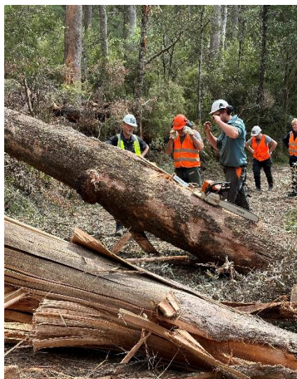
Mansfield Alpine 4WD Club undertaking Track Clearing