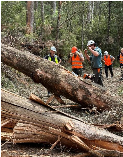
Mansfield Alpine 4WD Club undertaking Track Clearing